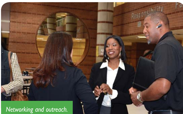
Networking and outreach.