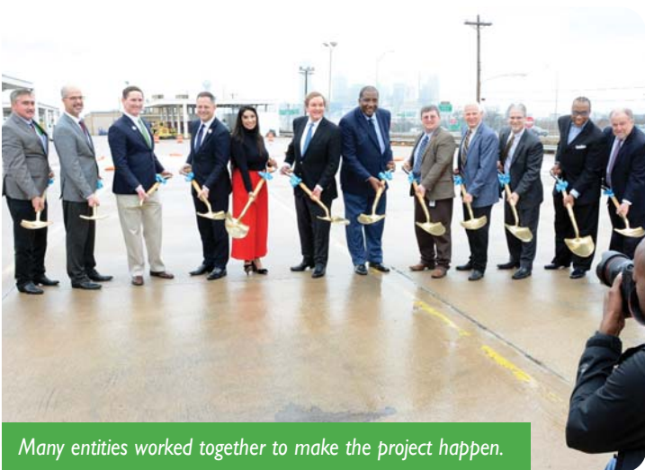
Many entities worked together to make the project happen.