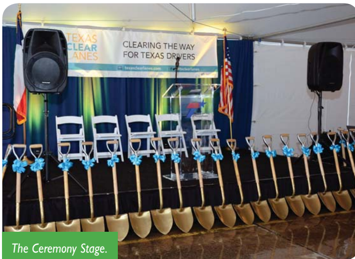
The Ceremony Stage.