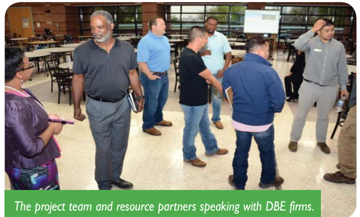
The project team and resource partners speaking with DBE firms.