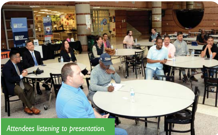
Attendees listening to presentation.