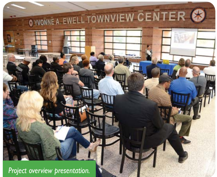
Project overview presentation.