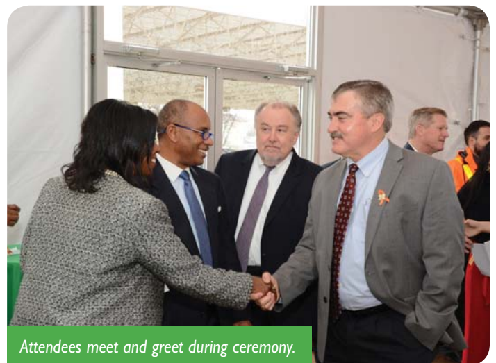
Attendees meet and greet during ceremony.