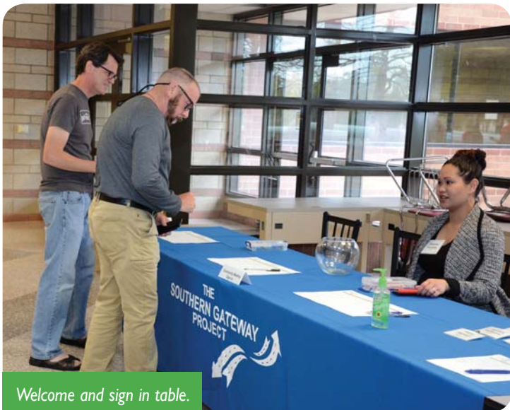
Welcome and sign in table.

If you're part of a group that would like to request a speaker from the project, a request form is available online by visiting www.thesoutherngateway.org under the Connect With Us tab. Just tell us about the organization or group, how you would like us to participate, the meeting/event information and someone from our team will contact you.