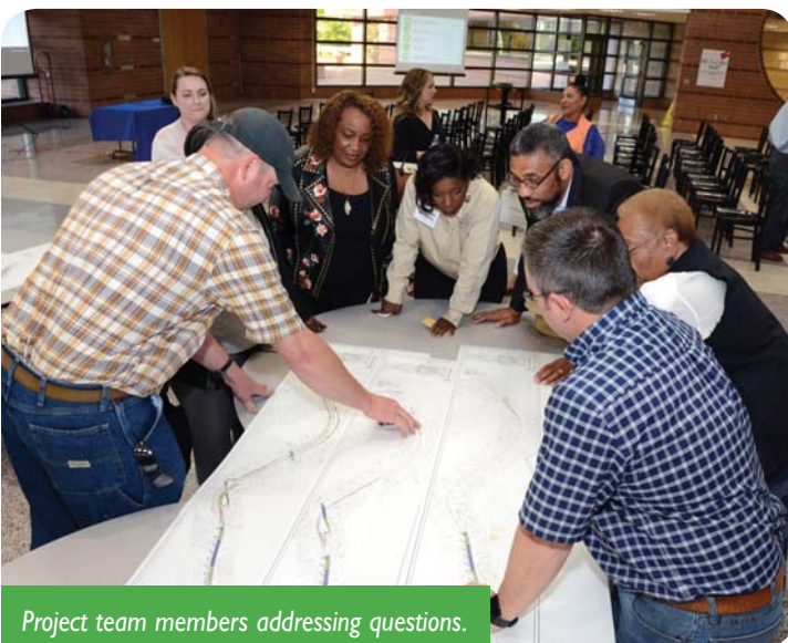
Project team members addressing questions.