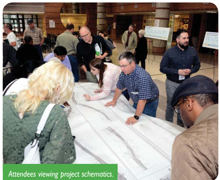
Attendees viewing project schematics.