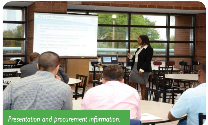
Presentation and procurement information.