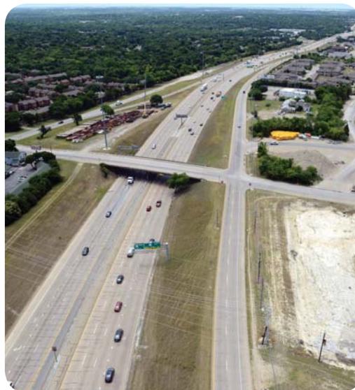
Aerial views of construction preparations on I-35E.